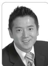
XIANG ZHI International Exhibition Management

Messe Essen GmbH Messehaus Ost Norbertstraße 45131 Essen - Germany Phone: +49 201 7244-727 Fax: +49 201 7244-513 E-Mail: xiang.zhi@messe-essen.de