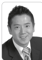
XIANG ZHI International Exhibition Management

Messe Essen GmbH Messehaus Ost Norbertstraße 45131 Essen - Germany Phone: +49 201 7244-727 Fax: +49 201 7244-513 E-Mail: xiang.zhi@messe-essen.de